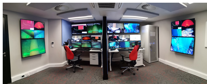
ROC control room displaying video footage of subsea inspection

With a global track record as the world's leading Geo-data specialist, Fugro has extensive experience in global remote operations. We deliver industry leading solutions and real-time insights needed to manage your offshore projects safely. Our continuous developments in remote operations support the global remote and autonomous revolution.