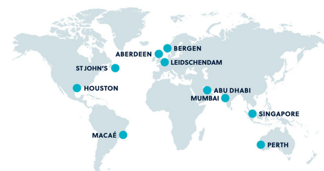
Highlighted locations of our various ROCs