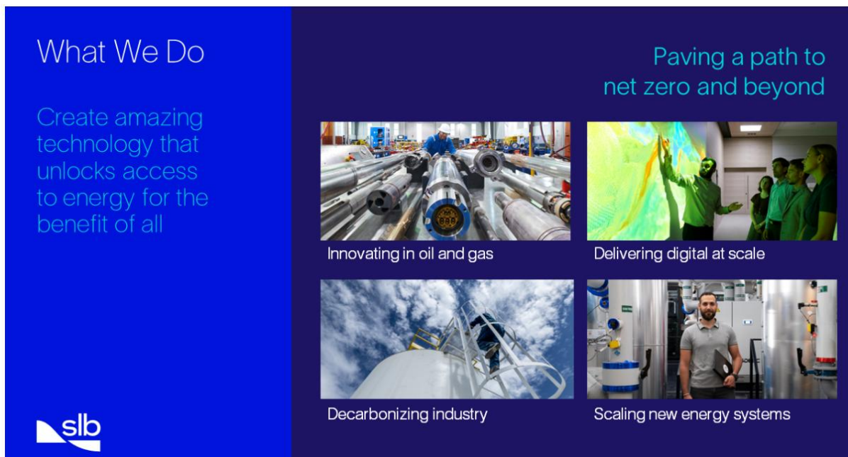
Figure 1 SLB at a glance